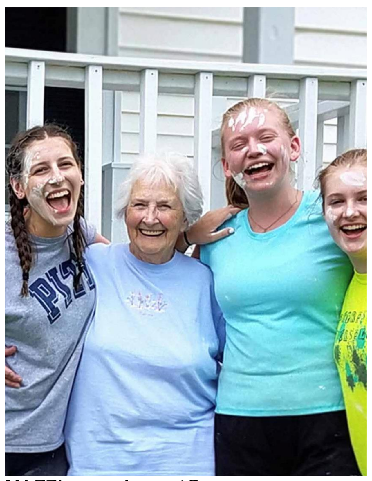
MATE's 2020 Annual Report